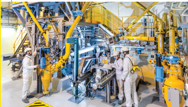
Conversion services carried out at our facilities in France for our customers worldwide.

The only operating industrial conversion site in the world being fully modernized with new facilities and innovative processes, while achieving a reduced environmental footprint.