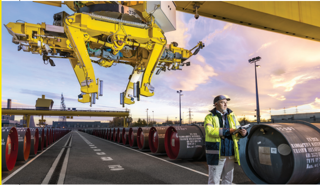
Enrichment services carried out at the Tricastin site in France for our customers worldwide.

A state-of-the-art facility using the most competitive technology