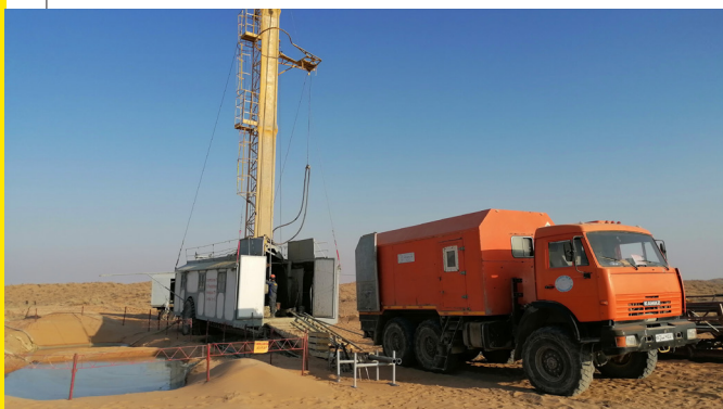
Exploration in Uzbekistan.

Diversified reserves and resources provide our customers with twenty years worth of production visibility.