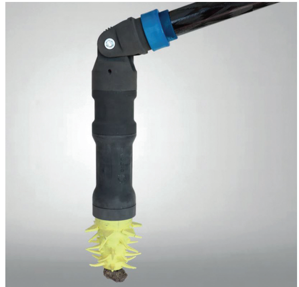
Anemone sampling tool installed on a pole