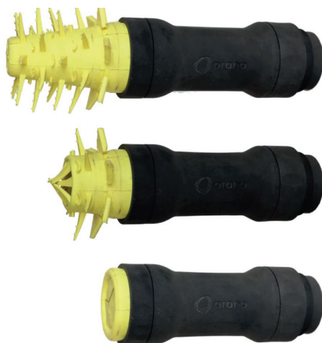
Anemone sampling tool head positions