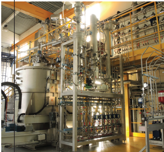
Full-scale pilot fully commissioned in 2020