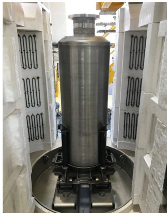
DEM&MELT is a full and integrated solution