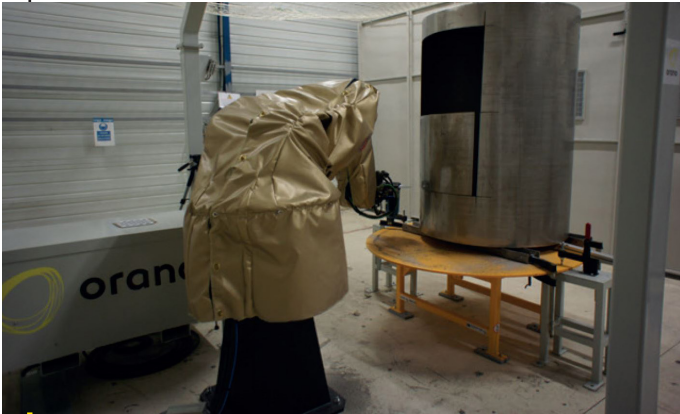
DEROSA operating on a representative model drum in a shielded containment area

Cutting operations are performed on representative models of containers made of stainless steel.