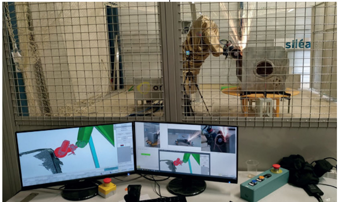
The DERSA cutting system has a user-friendly HMI