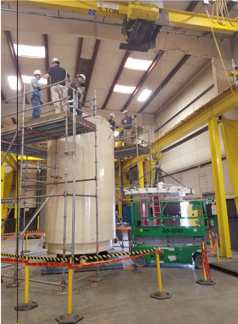
The Orano team examining the TN-32B cask

the SNF and the canister/cask containing the SNF that might impact functions credited for structural confinement or maintaining sub-criticality.