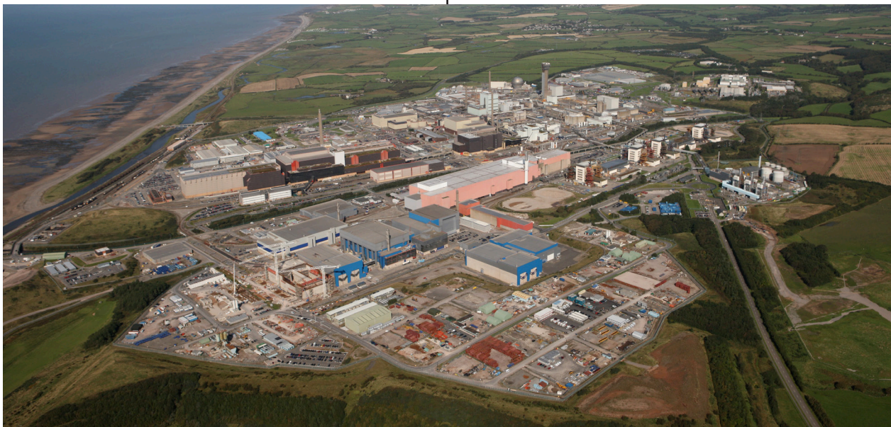
Aerial view of the Sellafield site where LEOPARD was integral in the RAHF D&D project. BNFL, England.

LEOPARD has been integral in the waste management program for dismantling the Redundant Active Handling Facility (RAHF) at the British Nuclear Fuels Ltd (BNFL) Sellafield site in England. The RAHF had been used to treat used fuels and housed approximately 100 workshops and hot cells with dose rates up to 300 mSv/h (30 R/hr).