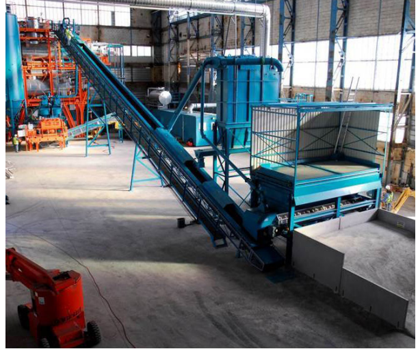
The TDU treats soil particles measuring less than one-third of an inch

In conclusion, over two tons of mercury were recovered, of which more than 772 pounds were pure, elemental mercury from the TDU output; and