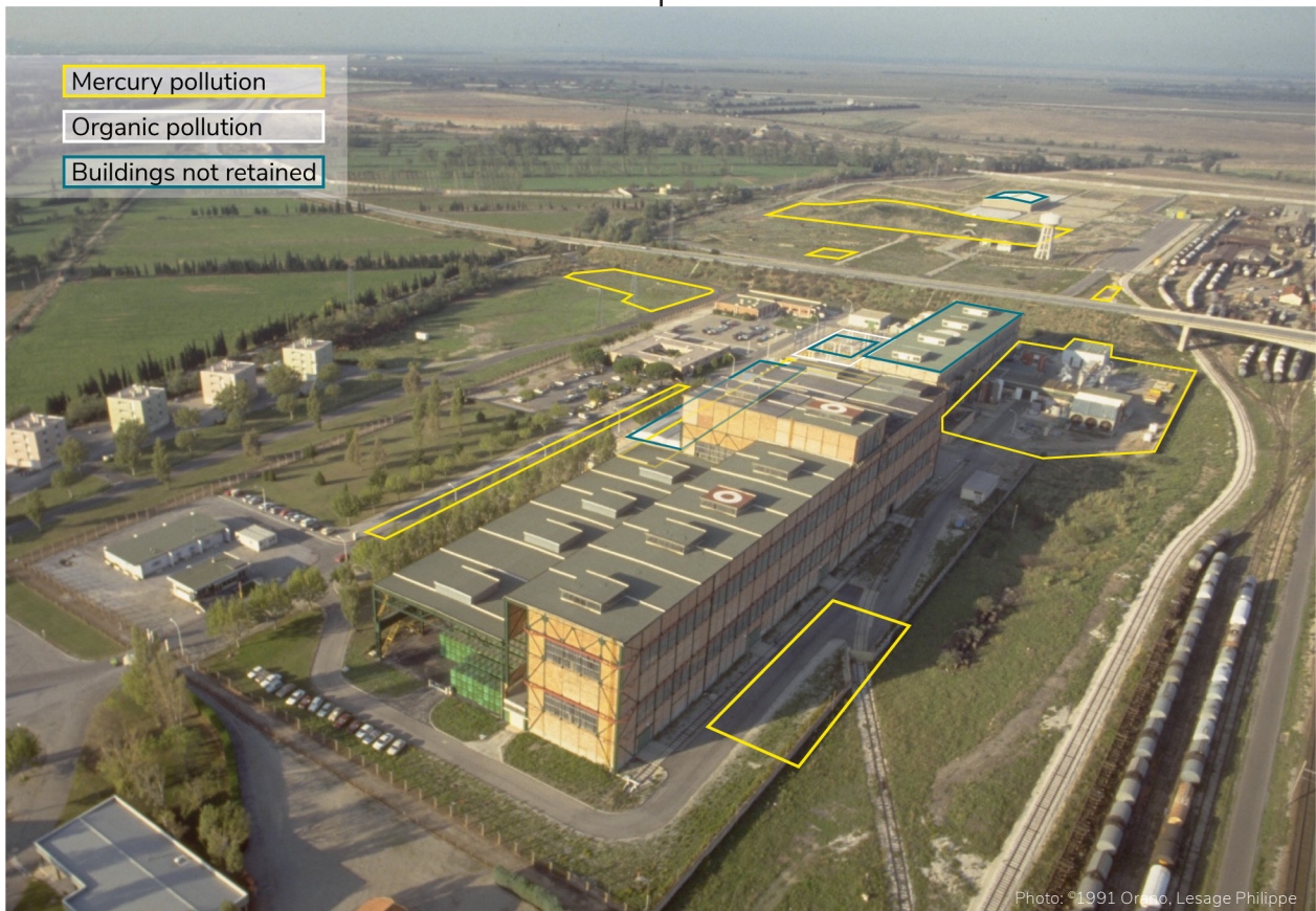
Polluted areas at the Miramas site

There was a large mercury contamination on the Miramas site as the result of lithium isotope activities that started in 1961. The lithium isotope production used tens of tons of liquid elemental mercury, and spillages were frequent. Lithium isotope separation continued until 2000 and was followed by a lithium recycling program from 2000–2002. All of these activities impacted the level of mercury on the soil, building structures, and effluent pipes and drains.