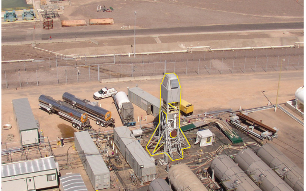
Mobile evaporator at Palo Verde Generating Station, Tonopah, Arizona

The design and fabrication of a mobile evaporator would significantly reduce the overall risk to SST retrievals and the impact of any future tank failures by adding the capability to reduce liquid volumes at the source and potentially eliminating cross site transfers particularly if the failure was in west farm.