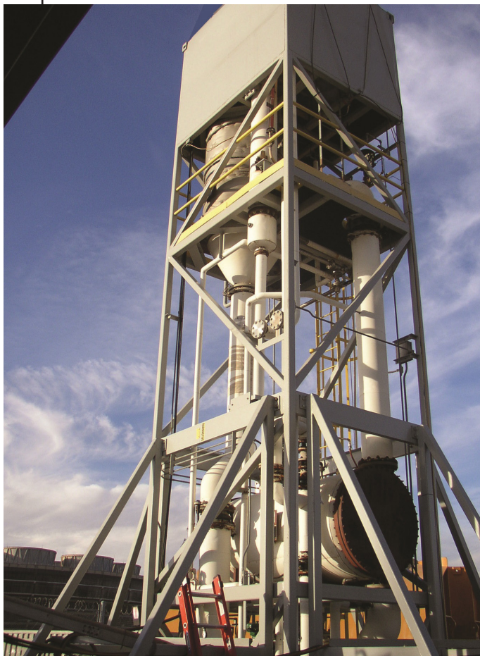
Orano's mobile evaporator

To concentrate caustic supernate solutions from Hanford tank waste by driving off excess water and minimizing double shell tank (DST) storage requirements and/or need for additional DSTs.